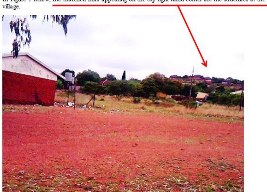
In Figure 1 below, the thatched huts appearing on the top right hand comer are the structures at the cultural

The school is situated very close to a cultural village; approximately 800m (see Figure 1). This cultural village showcases the cultural diversity that populates South Africa. There are six cultures that are represented at the village vis- a- viz Tswana, Ndebele, Venda, Tsonga, Zulu and Xhosa. According to the school principal, although the school community is multicultural, the dominant culture is Tswana. The workers at the cultural village are able to showcase various indigenous activities appropriately in their historical and socio-cultural background. The cultural village therefore acts as an avenue for elderly and traditional educators/ practitioners to pass their knowledge and skills generationally. The proximity of the school to the cultural village provides opportunities for both teachers and learners to learn about the indigenous knowledge systems of the local cultures. Mosimege (2004) argued that cultural villages could serve more educational purposes than being mere tourist centres.