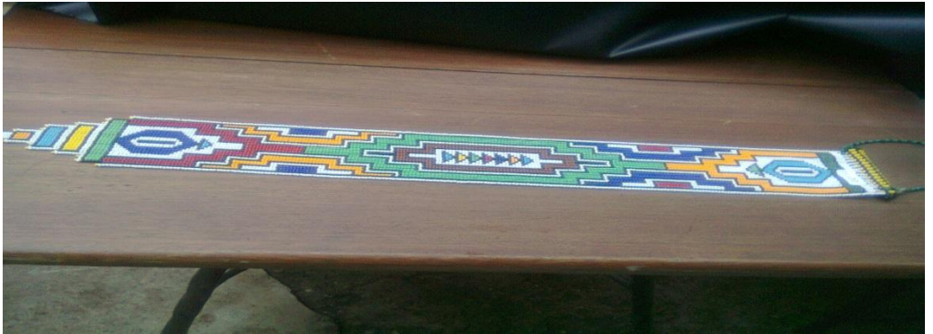
Figure 3: Ndebele beadings

All the three teachers reiterated that learners can use their mathematical knowledge to increase their participation at the cultural village. Also learners can create self-employment after school through designing Venda traditional materials applying their mathematical knowledge of shapes and transformations. Hence mathematical knowledge can be used to boost economic empowerment.